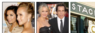
Whaleman Benefit 'Tropic Thunder' premiere ASCAP Final performance

PARTIES > RED CARPETS > CELEBRITIES AT COMIC-CON >